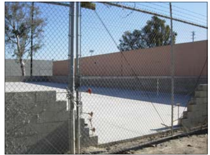
This spring the foundation was laid in preparation for erecting the warehouse addition.

To learn more and make a donation to this project visit www.foodbankofsocal.org/index.php/about-us/our-building or call 562.435.3577.