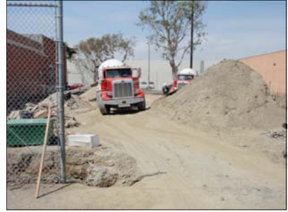
Truckers haul away dirt to create the needed space for the expansion project.

To meet the needs of the expanding service population of hungry people right here in the community, The Foodbank must distribute more food than it ever has in its 35 year history. To facilitate its cost-effective food distribution programs, The Foodbank is engaged in a Facility Expansion Project that will increase the dry storage capacity of USDA Commodities, increase FIFO (first in first out) efficiency by reducing the number of product moves, provide ample space for staging orders, and enable the simultaneous use of forklifts, electric hand jacks, and hand jacks. The building addition consists of approximately 10,000 square feet and will adjoin the existing facility.